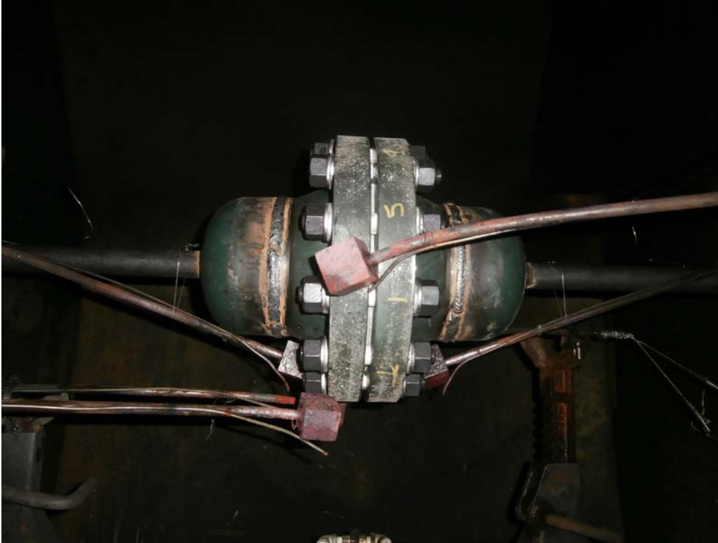
Test Setup Prior to Burn