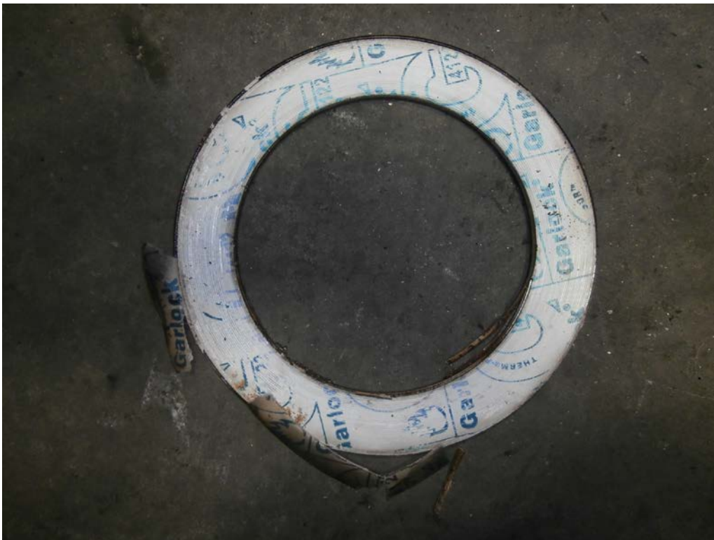
Burn Test Gasket