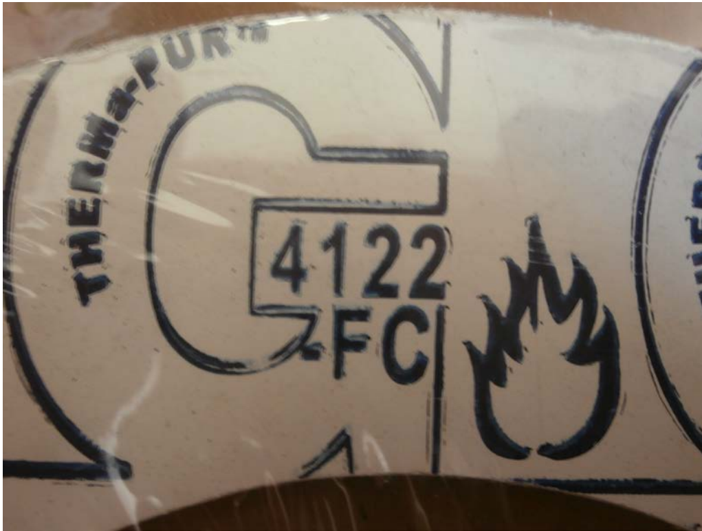
Test Gasket Prior to Burn