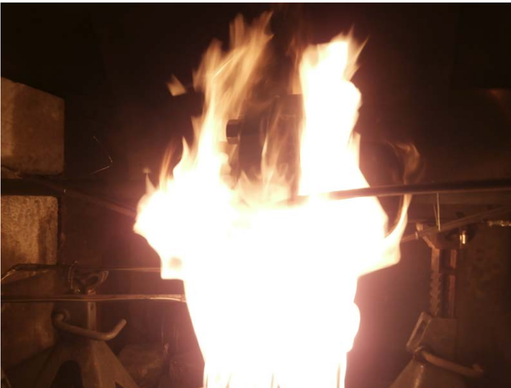
Test Gasket During Burn