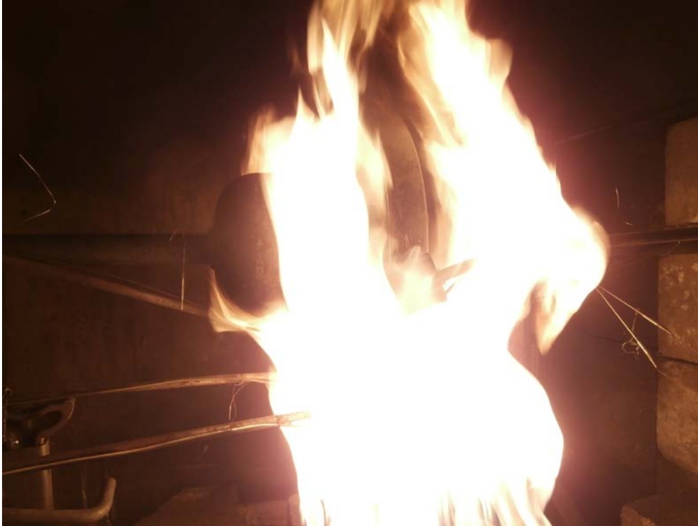
Test Gasket During Burn