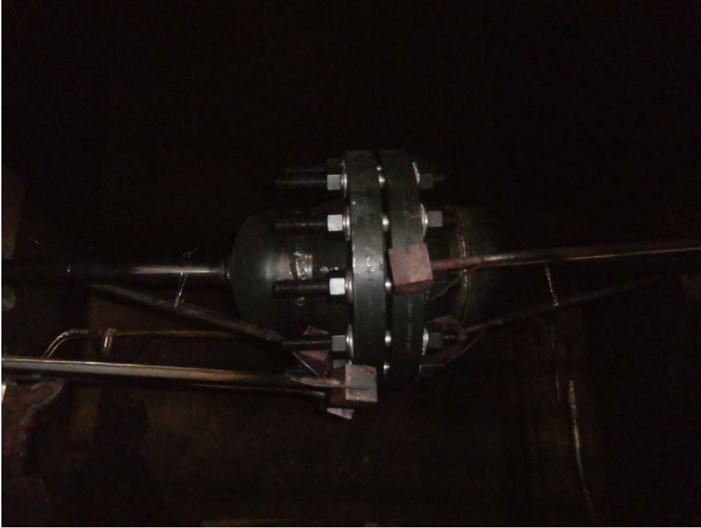
Test Setup Prior to Burn