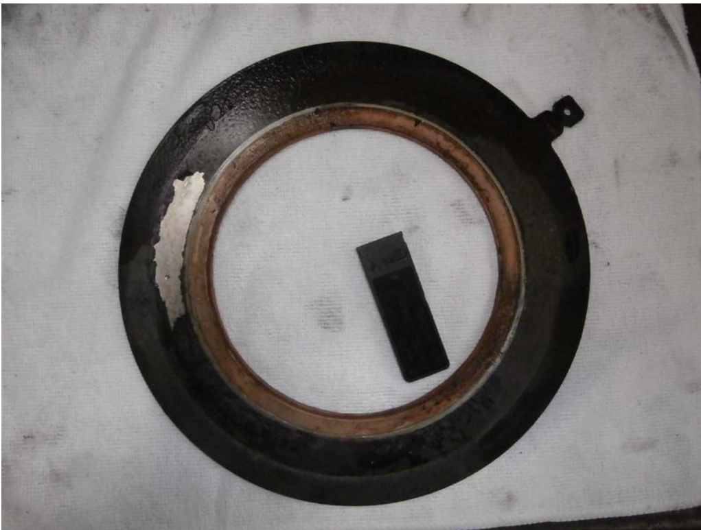
Test Gasket Post-Burn