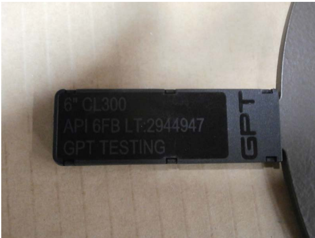
Test Gasket Prior to Burn