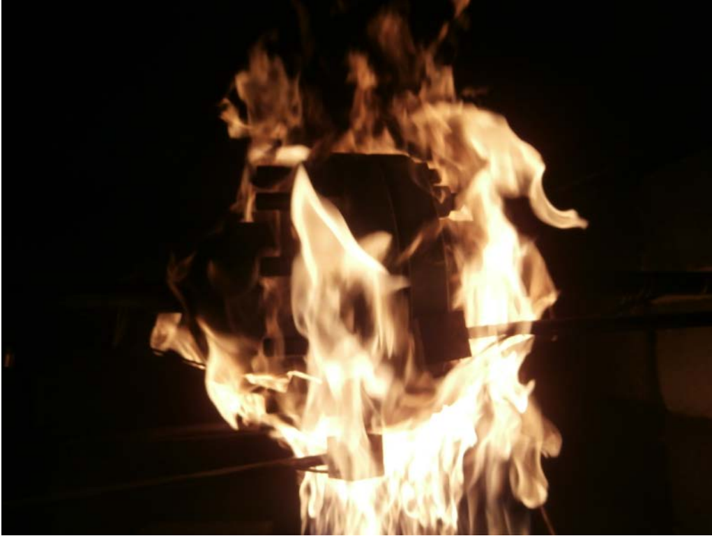
Test Gasket During Burn