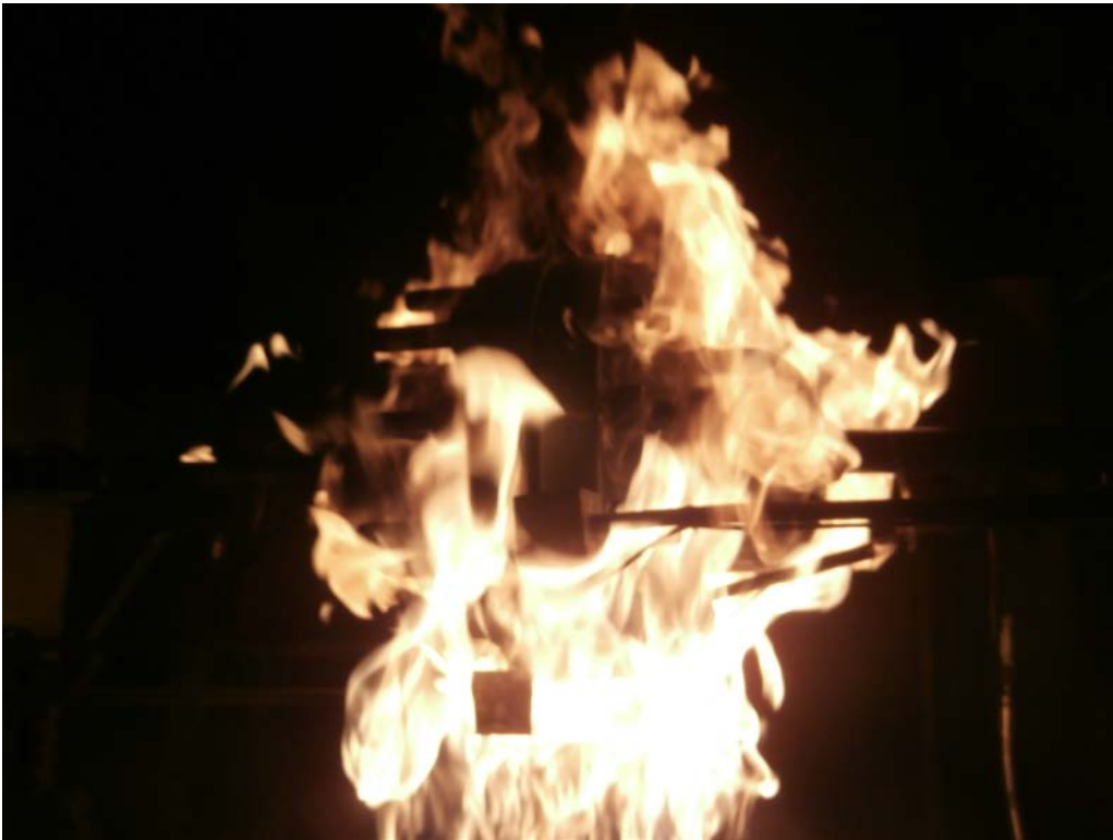
Test Gasket During Burn