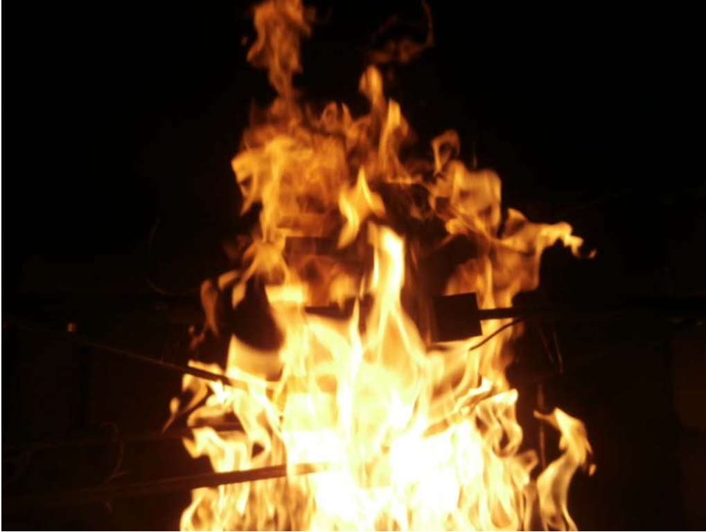
Test Gasket During Burn