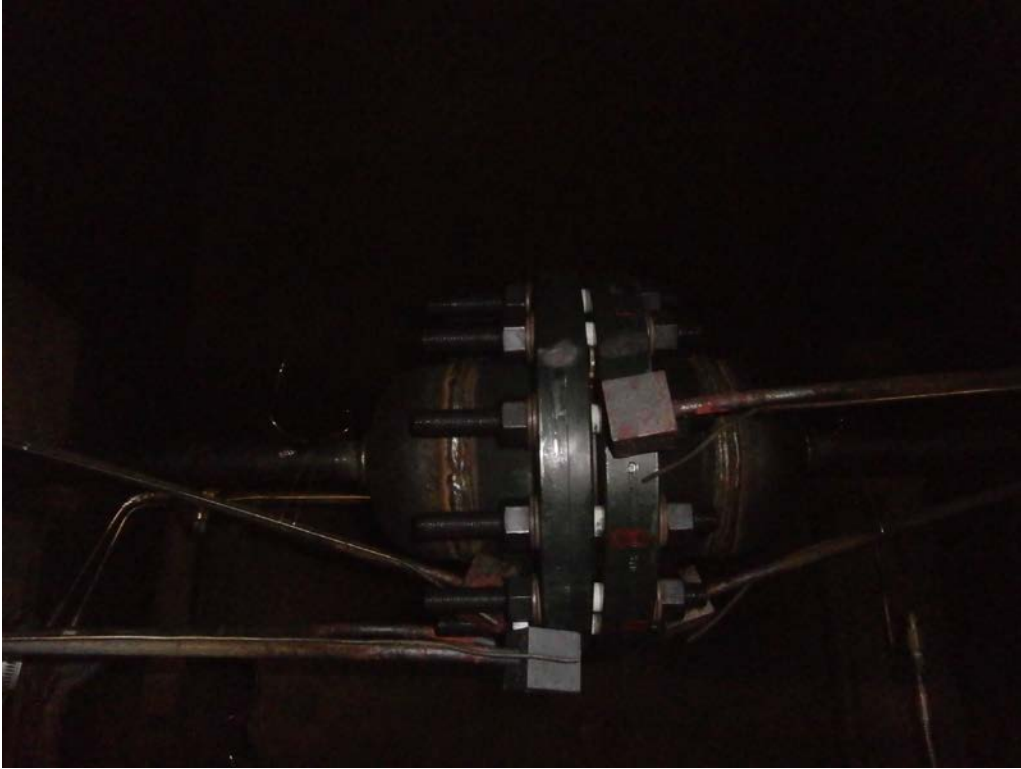
Test Setup Prior to Burn