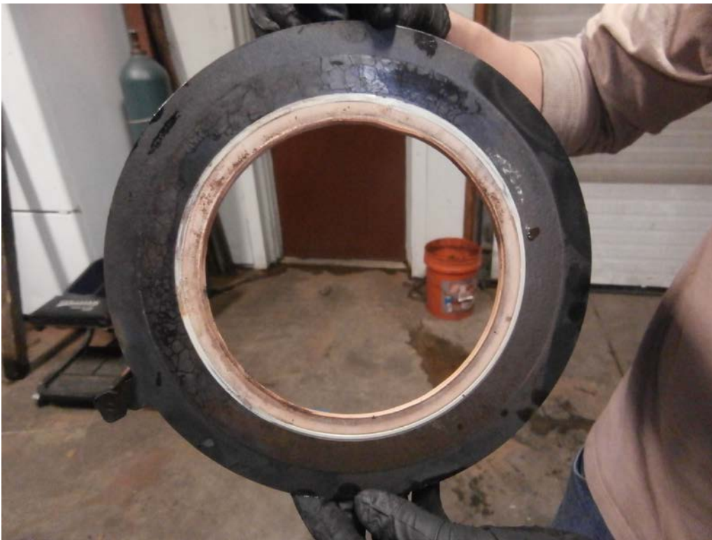
Test Gasket Post-Burn