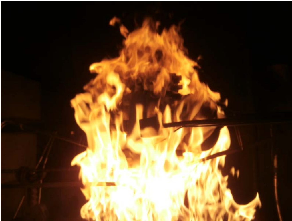
Test Gasket During Burn